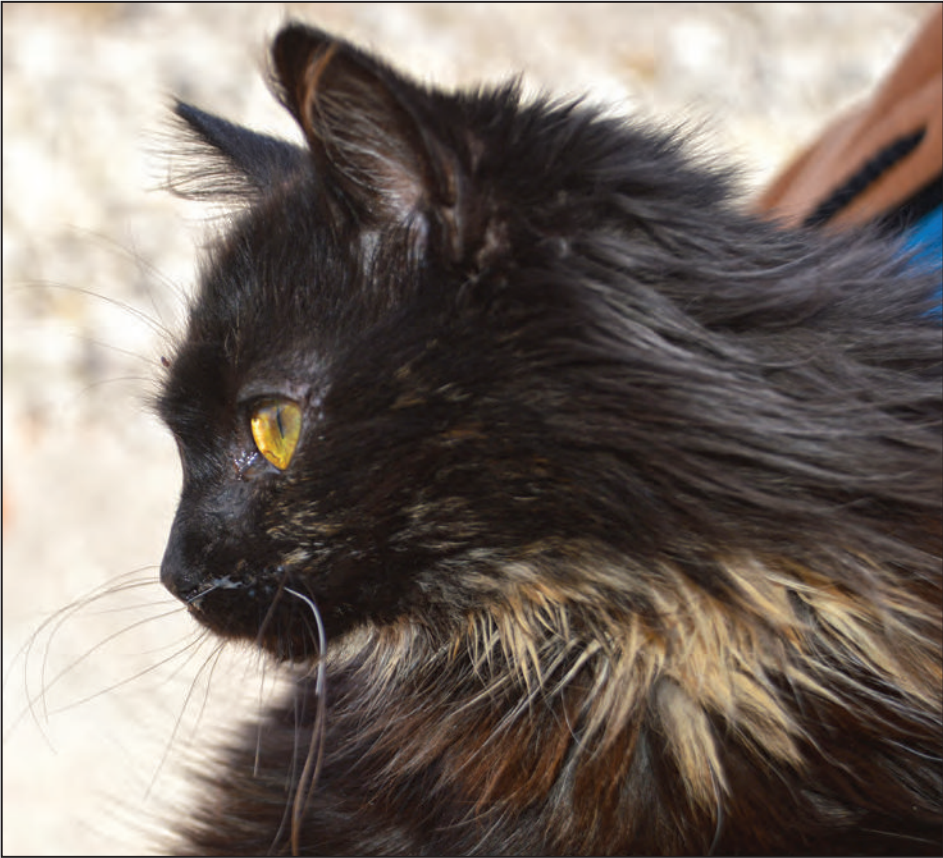
This ball of fluff is in need of a good home. She is approximately 10 months old and very friendly. Her adoption fee is $77, which includes spay and rabies vaccination. Warren County Animal Control and Adoption Center is located at 169 Paws Trail. Serious inquires only may call 507-3647.