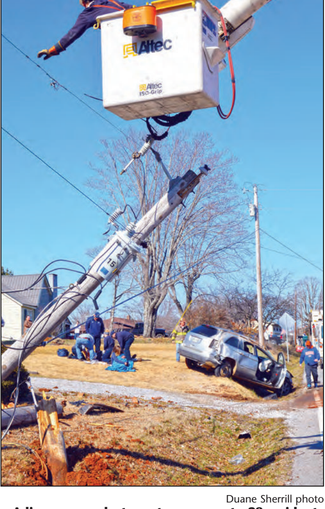
A lineman works to restore power to 28 residents who lost power following a Monday morning wreck