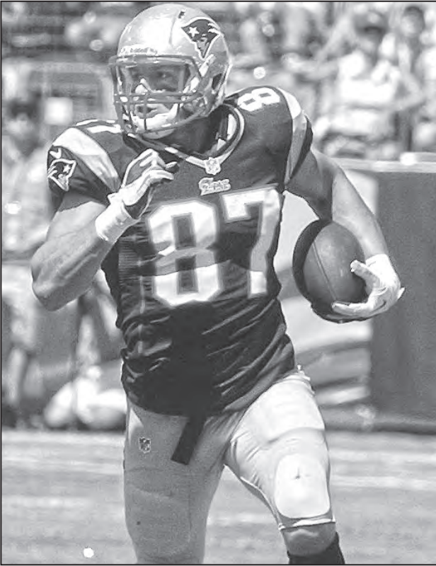
Rob Gronkowski has been cleared to play in Sunday's Super Bowl LII.

Blount, who won two Super Bowls with Gronkowski and the Patriots before joining the Eagles, dominated his virtual matchup on Xbox in front of a packed crowd of Patriots fans at a Microsoft store. They left disappointed as Blount led his Eagles to a 33-13 win over Patriots.