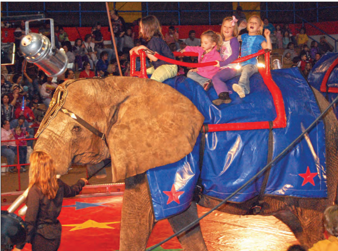
Elephant rides during intermission are always a popular part of a Circus Pages show.

It will be a chance to see lions and tigers and motorcycles. The family excitement of Circus Pages makes its return to McMinnville Civic Center next Friday, Feb. 9, for two shows at 4:30 and 7:30 p.m. Circus Pages has been making an annual stop in McMinnville for more than 10 years. The show is a heart-pounding blend of acrobatics and animal acts. In between, juggling clown antics provide a barrel of laughs. Circus Pages boasts an impres-