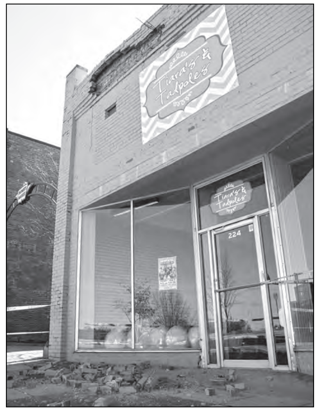
The former home of Tiara's & Tadpoles is having issues with its crown. Caution tape was placed in front of 224 E. Main Street to protect pedestrians from falling bricks which came loose from the top of the building.

The Vanilla Bean Baking Company has been a homebased bakery on Ben Lomond Street. Plans are to relocate from the residence to Main Street.