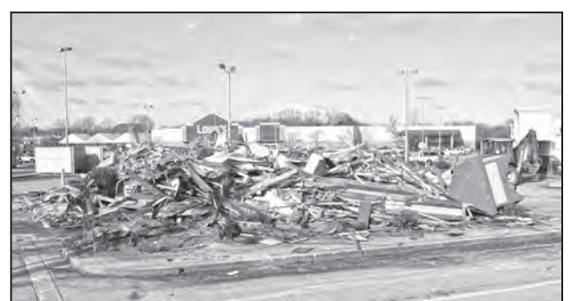
The former Rafael's building has seen better days.