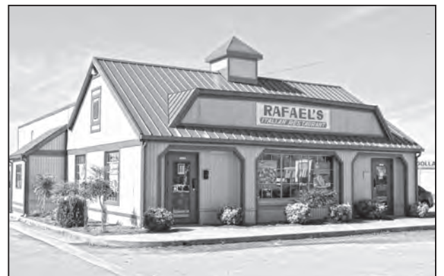
This building at Cumberland Plaza served as home to Rafael's Italian Restaurant for 17 years.