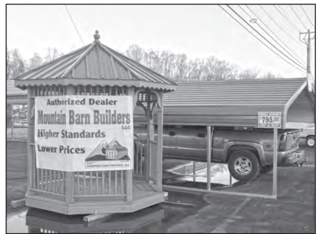
Outdoor Accessories has a wide range of merchandise including gazebos, carports, buildings, playsets and animal shelters. Prices start at $695 for carports and $1,595 for buildings.