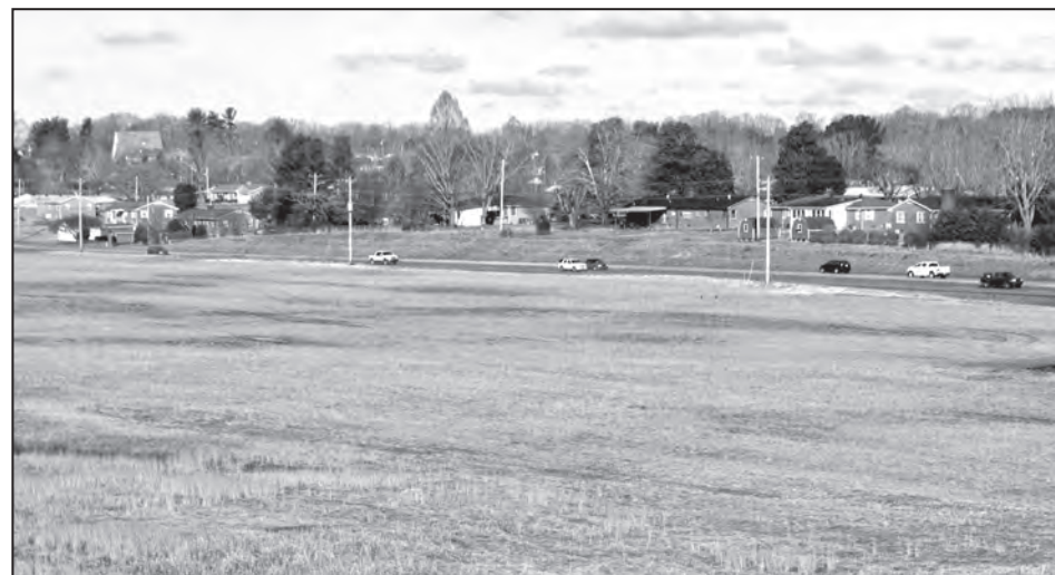
The open acreage on the corner of the bypass and Spring Street continues to stir interest, but a deal has yet to be reached.