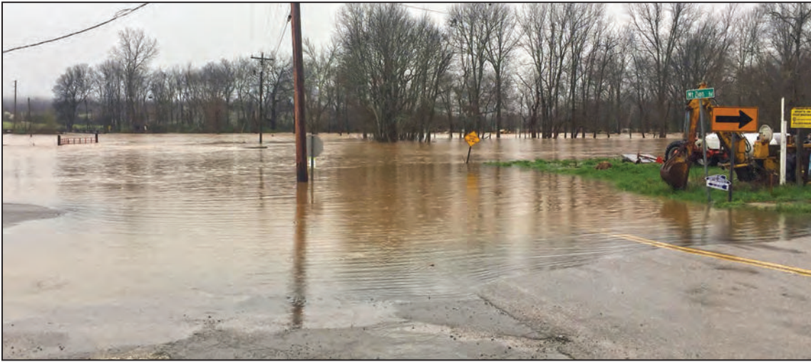
Pictured is the intersection of Mt. Zion Road and Viola Road off Town Square in Viola.