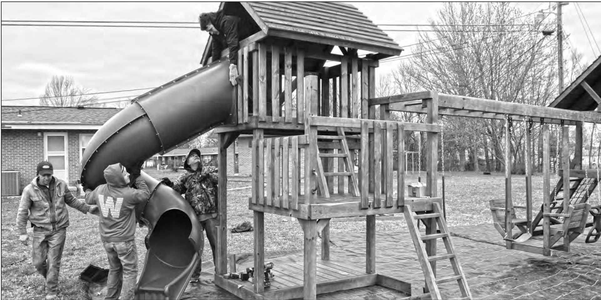
One of two slides is attached to the new playset at McMinnville Housing Authority's complex in Morrison. The playset was made possible by $7,000 in donations from members of the community.