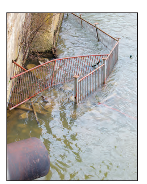
Railing from the dam overlook was washed into the river.

Both parks are located in a 100-year floodplain, which refers to the probability of that type of flood happening in any given year. A 100-year event has a 1 percent chance of occurring in any given year.