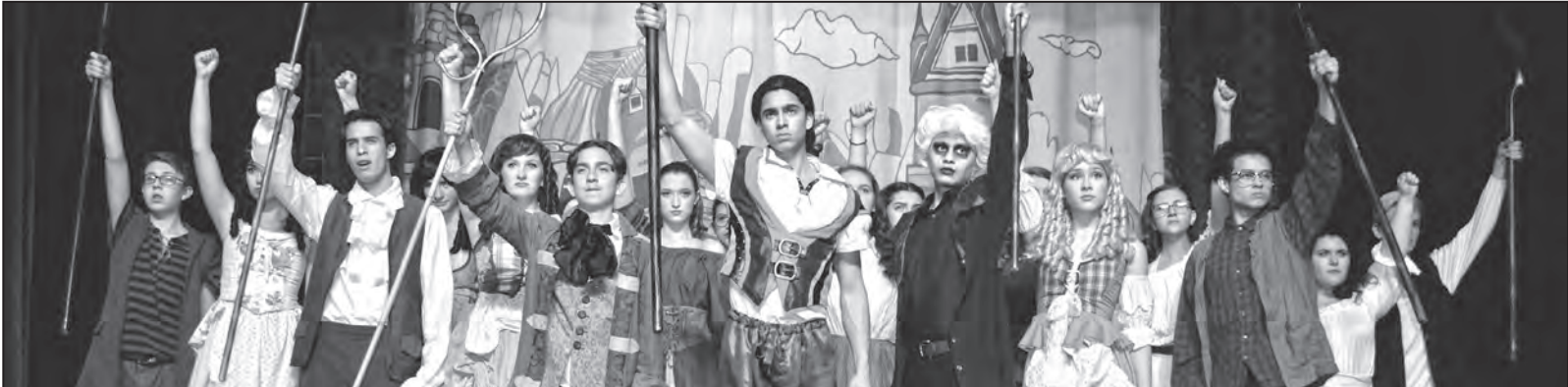
An angry mob forms to vanquish what is perceived to be an evil Beast in the Dream Reality Group production of "Beauty and the Beast." Tickets are sold out for four performances this week, but they are still available for an encore show set for Saturday, March 24, at 7 p.m.