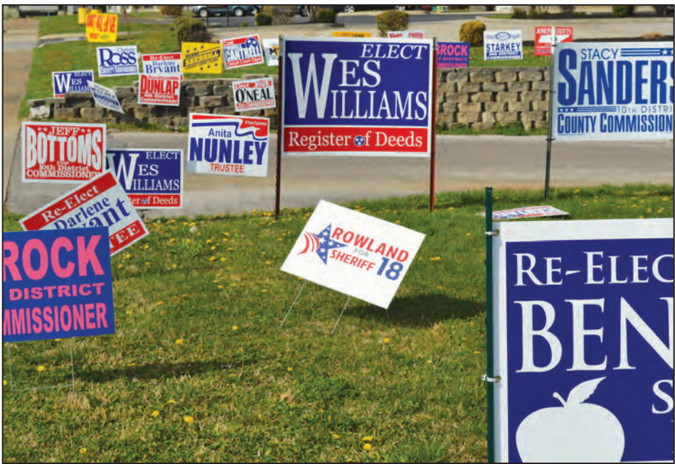
With campaign signs flooding the county, city codes officials want to remind candidates to place them properly and abide by sign guidelines.

location, shape, illumination or color. • No sign shall be located on, or attached to, any public property except public signs authorized by the city of McMinnville, Warren County, or the state of Tennessee. • No sign shall be located on or overhanging any public right of way. In many, but not all cases, the public right of way is between the utility poles or fence along the roadway. • No signs shall be painted or attached to any fence, trees, rocks, canopy posts, utility poles, and the like. • Political signs may be displayed on private property with the consent of the owner. By state law, it is unlawful for any person to attach show cards, posters, or campaign materials on poles, tow-