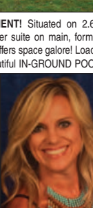
BEST OF THE BEST REALTOR 2017