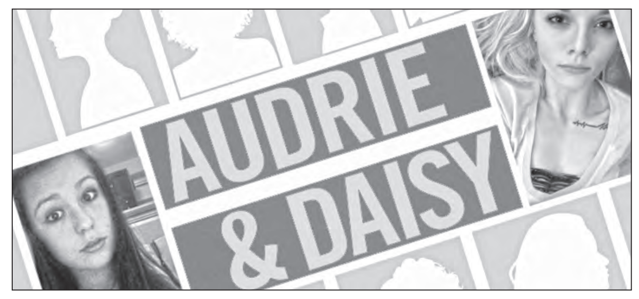
Families in Crisis is raising awareness about sexual assault on Thursday, April 12, at 6 p.m. with a viewing of "Audrie & Daisy" at Park Theater. It is free to the public.

Students were allowed to wear fatal vision goggles which provide visual impairment similar to being legally intoxicated. They were asked to drive the department's Drunk Busters Pedal Kart. The kart was recently purchased using a grant from the Tennessee Highway Safety Office.