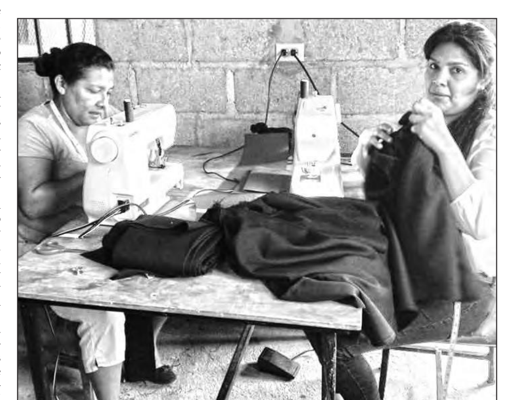
Honduran women add finishing touches to school uniforms with sewing machines and fabric purchased with mission funds.

În June, volunteers will build approximately 35 to