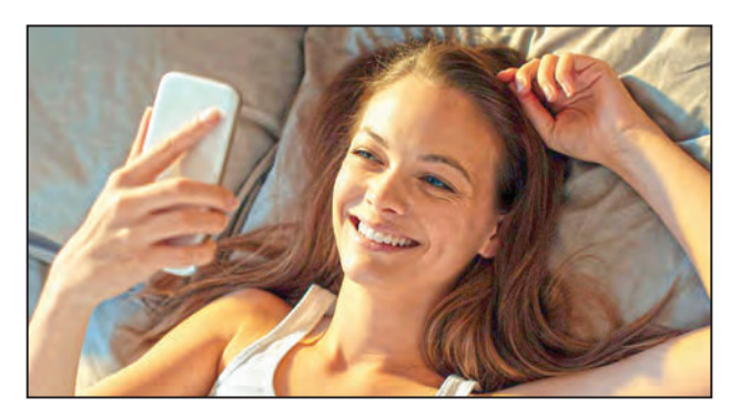
According to cyberbullying.org, 26.3 percent of 17-year-olds surveyed have received a sexually suggestive picture on their phone.

BY LACY GARRISON Reporter for the Southern Standard (McMinnville, Tennessee)