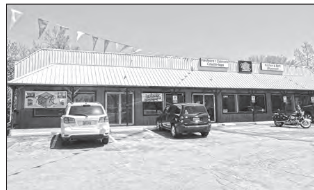
The RSR Kitchen and Bath showroom is located at 1710 Smithville Highway. It's open six days a week, Monday thru Saturday.