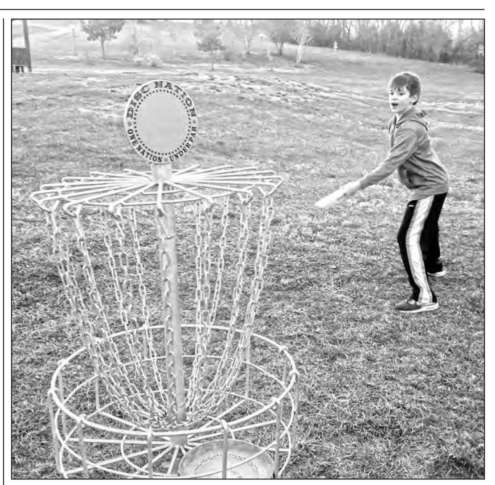
A Disc Golf Tournament is being organized for all ages to be held at Pepper Branch Park. The deadline to register is May 2 at the Civic Center.