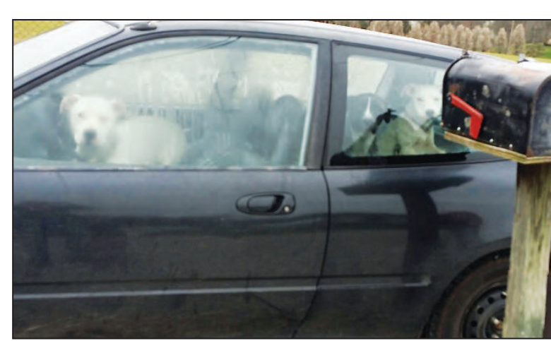
According to an arrest warrant, the three dogs were found living in a Honda Civic with a strong odor of feces.