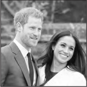
Prince Harry and Meghan Markle are scheduled to wed this Saturday.