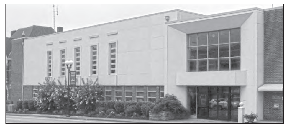
Harriman Utility Board is located in Roane County in East Tennessee. The population of Harriman, according to the 2010 census, is 6,350.