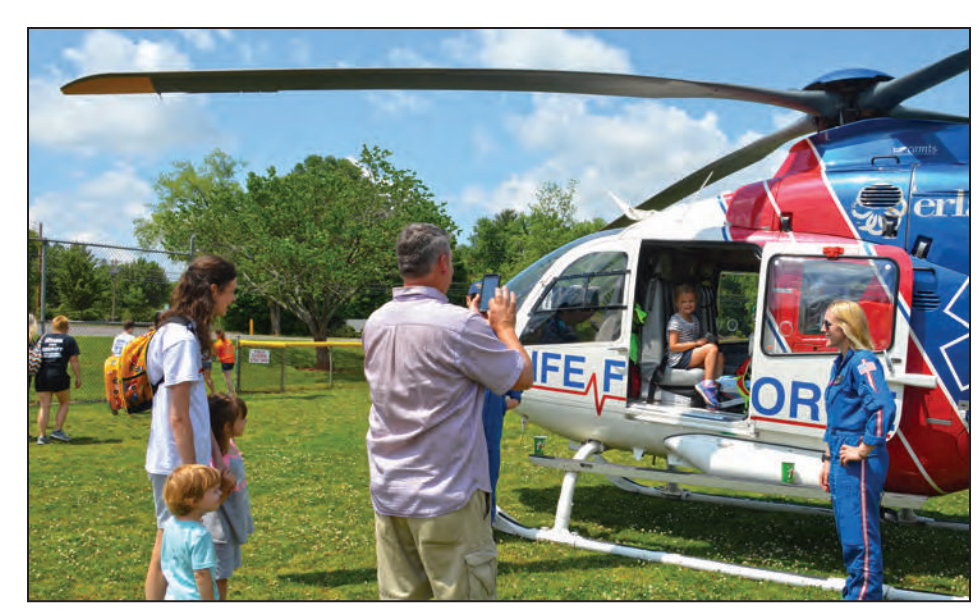
Children received a special treat when three helicopters arrived. They were sent by Vanderbilt's LifeFlight, Erlanger's Life Force, and the independently owned Air Evac Lifeteam.

Organizers also gave away 100 T-shirts, snow cones and popcorn, as well as the giveaways provided by vendors.