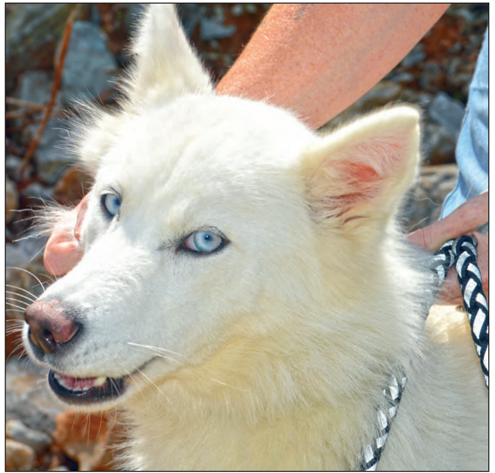
Mae, an 18-month-old husky mix, is in need of a new home. She has been sponsored for adoption, meaning her adoption fees are being paid by a third party. Warren County Animal Control and Adoption Center is located at 169 Paws Trail. Serious inquires only may call 507-3647.

McMinnville WARREN COUNTY, TENN. • WHERE LIFE'S IN FULL BLOOM •