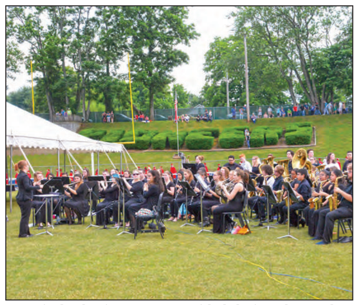
Musical selections were provided during the graduation ceremony by the high school band.