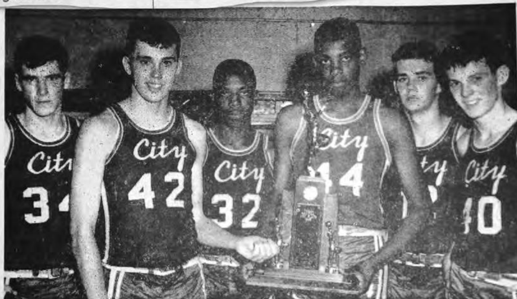
REGION RUNNERSUP — The six Rebels who played against Sparta Saturday night in the Region IV championship game at Mufreesboro are pictured with the second place trophy after