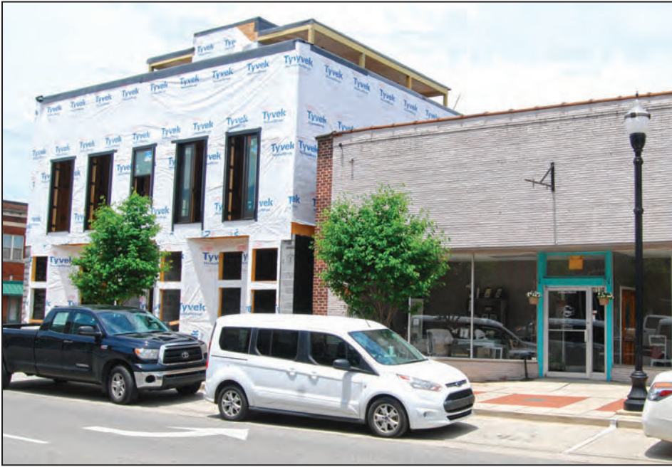
Vintique has moved to East Main Street in the building on the right. It's next to a downtown development under construction that will have two condos on the second floor and retail space on the first floor.