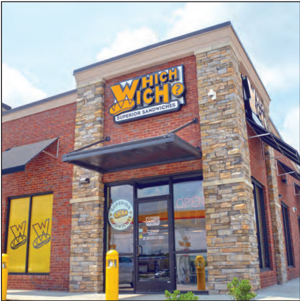
There will be a grand opening celebration this Wednesday from 10 a.m. to 6 p.m. at the new Which Wich and Quick Shop in Morrison.