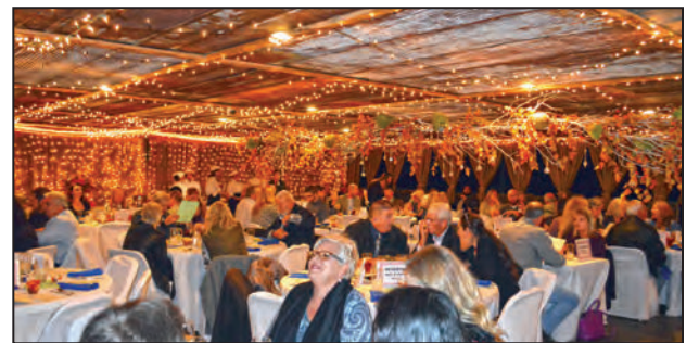
Angels Autumn Fest, held last year at Deer Path Farms, will be moved to McMinnville Civic Center this year and is scheduled for Sept. 27.

For more information about the event, CAC is located at 1350 Sparta Street and can be reached at 931-507-2386.