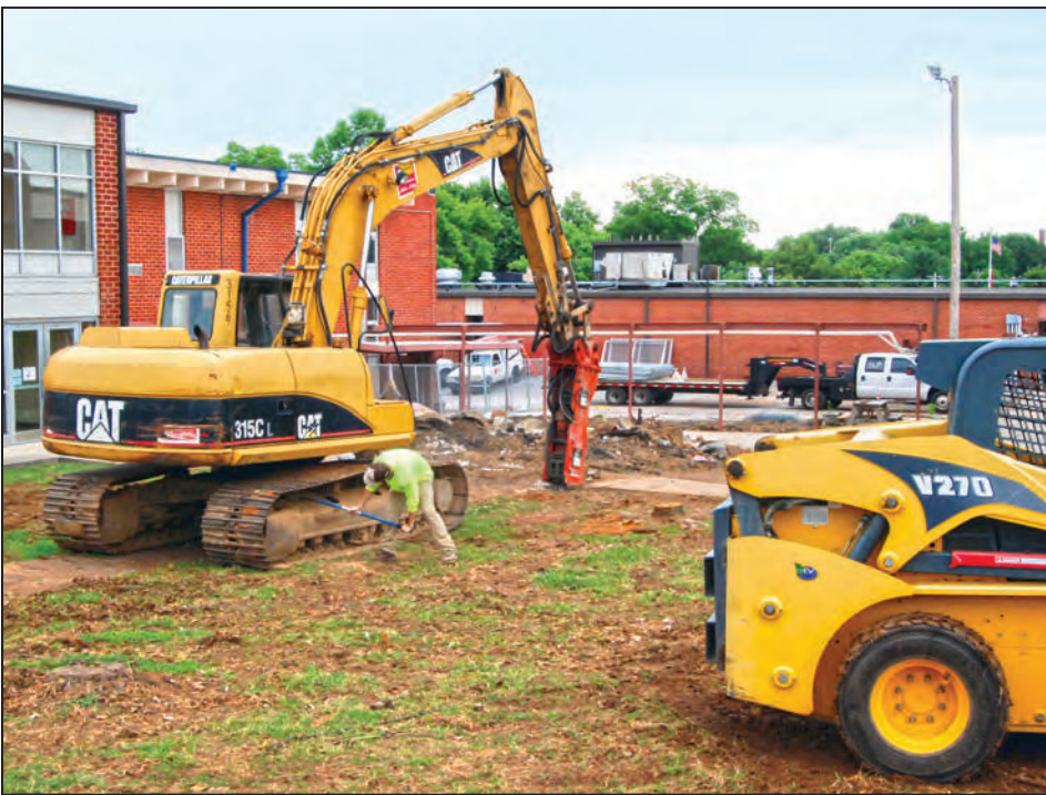
Construction is under way at Bobby Ray Memorial Elementary.