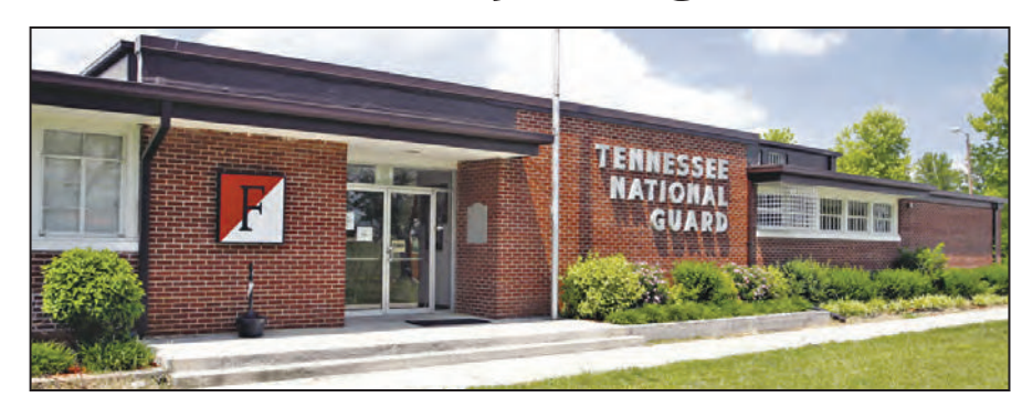
The current Tennessee National Guard Armory is located off Sparta Street in front of the jail. It will relocate to Manchester Highway.