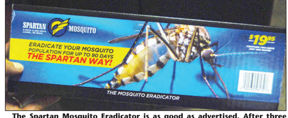
The Spartan Mosquito Eradicator is as good as advertised. After three