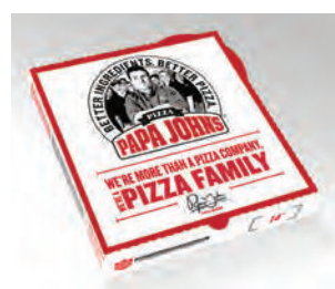
THAT'S ONE DISGRACED PAPA

Alas ... Movie Gallery is gone too, its spot at Walmart turned into a bank.