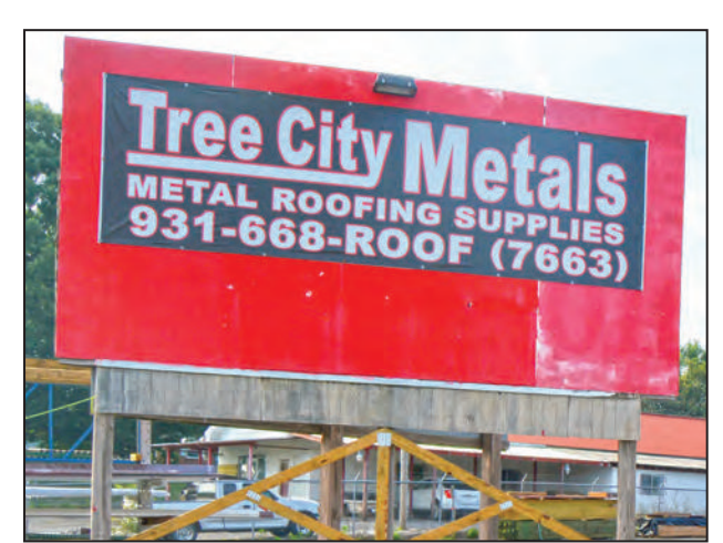
Tree City Metals is located at 92 Volunteer Drive and can be easily seen thanks to this billboard in the front parking lot.

One thing he says customers will appreciate about metal roofs is how the paint has become so much more durable over the past decade. He says any product exposed to the sun will experience some fading over