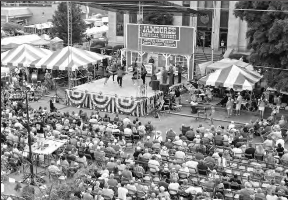
The famous Smithville Jamboree is set for this Friday and Saturday, July 6-7, in downtown Smithville.