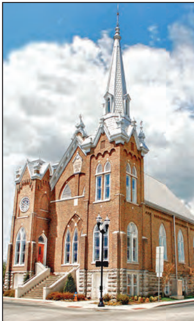
FIRST UNITED METHODIST CHURCH