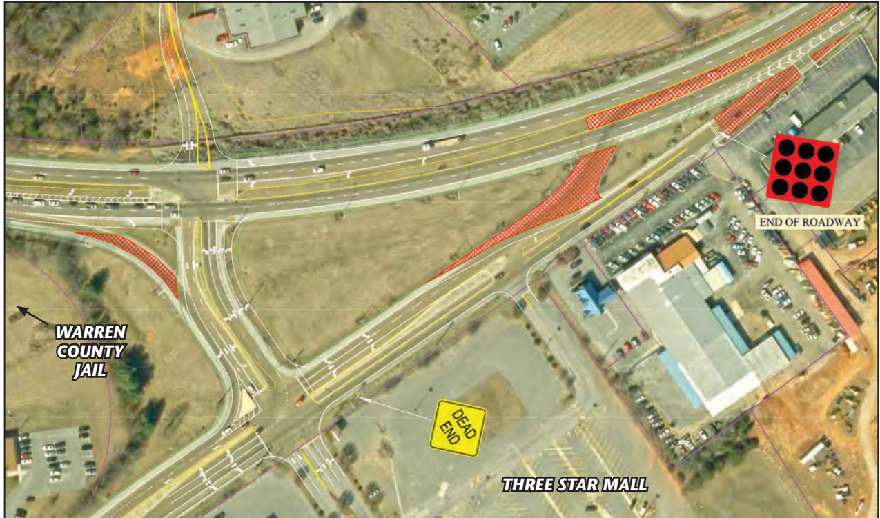
This design sketch from TDOT illustrates how the area in front of the mall will look when work is complete. The yellow lines show where traffic will flow after construction, including Magness Drive extending to intersect with the bypass. The red areas show where traffic will no longer flow, including Sparta Street becoming a dead end after U.S. Auto Sales.