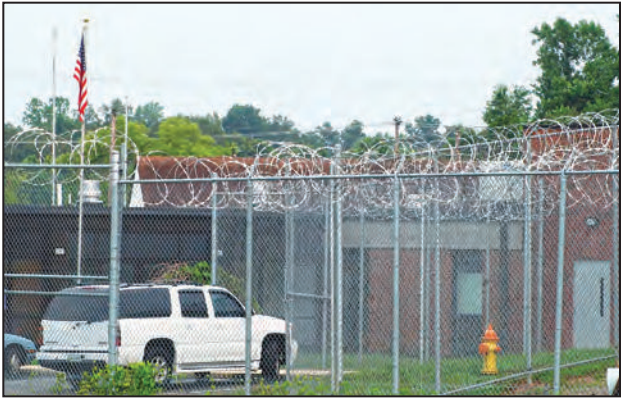
A planned jail expansion hit a snag when the lowest bid came in nearly $2 million over budget.