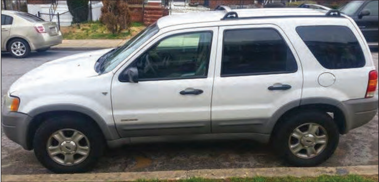
Police say the hit-and-run driver was behind the wheel of a vehicle similar to this one.

Information can still be provided by contacting McMinnville Police at 473-3386.