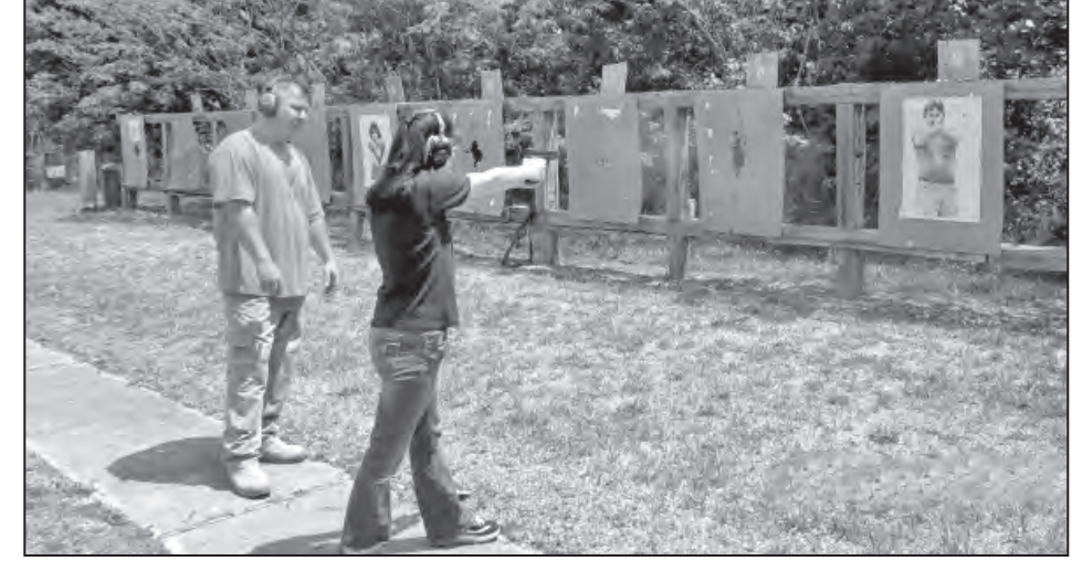
McMinnville's Citizens Police Academy offers a chance to shoot a gun on a firing range.

The seven-week course offers hands-on experience about the daily activities associated with law enforcement in McMinnville. The classes are an effort to bridge the relationship gap between police officers and the citiserve. zens they McMinnville Police Department officers are the instructors. "The academy has become a main part of McMinnville Police