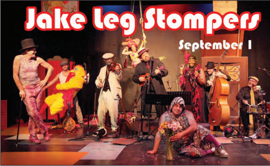
A Vaudeville-style show will be presented by the Jake Leg Stompers and the Eggplant Faerie Players for one performance on Sept. 1 at 7:30.