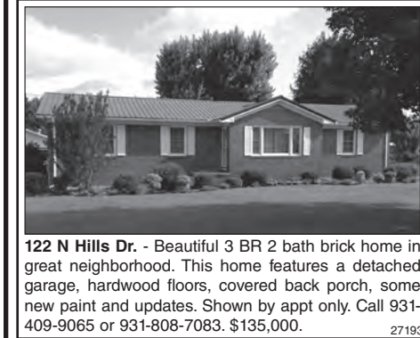
122 N Hills Dr. - Beautiful 3 BR 2 bath brick home in great neighborhood. This home features a detached garage, hardwood floors, covered back porch, some new paint and updates. Shown by appt only. Call 931-409-9065 or 931-808-7083. $135,000. 27193