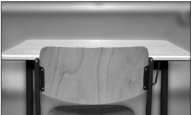
Students who regularly miss school can turn into employees who regularly miss work, educators say.