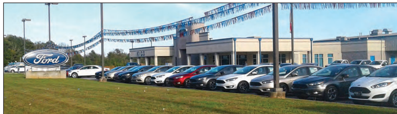
After 15 years in the community, a deal is in the works for Kidd Ford on Manchester Highway to change hands, according to speculation. An official announcement could be made as early as this week.