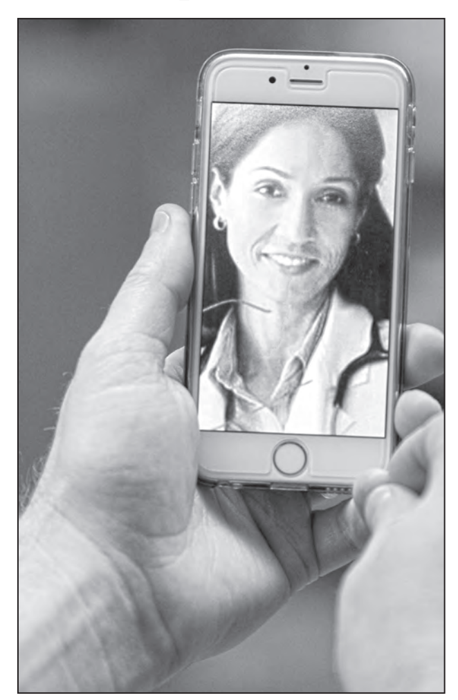
Too sick to leave the house, or don't want to spend time in a waiting room? Saint Thomas is offering a virtual clinic where you can receive medical care and prescriptions from the convenience of your smartphone. It can be accessed 24-7 for a flat $49 fee at www.STHealth.com/OnDemand.