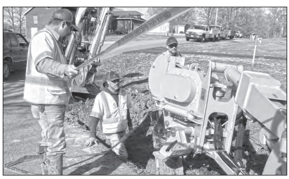
Ben Lomand Connect was announced on Tuesday as the recipient of a $1.1 million state grant to increase its broadband coverage area. Ben Lomand will match the grant with $1.1 million of its own money. Pictured are employees working to install broadband.

24-7 anywhere in Tennessee. The best part is it can be accessed using a smartphone, tablet or computer.