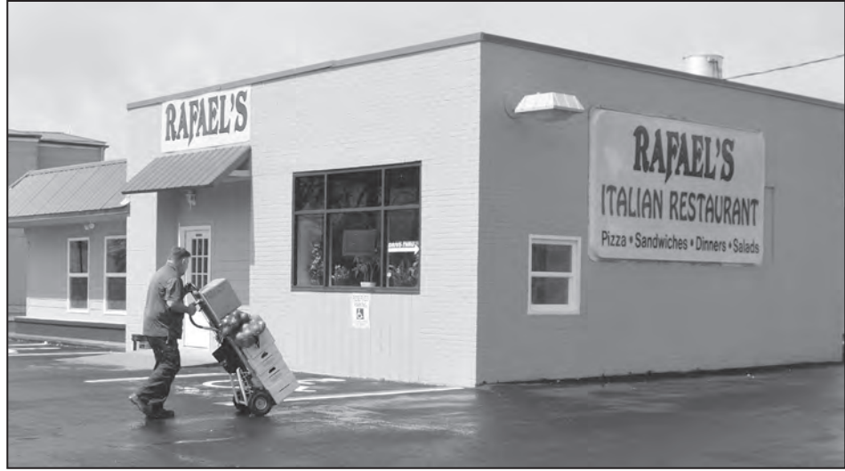
Food is delivered to Rafael's Italian Restaurant on Friday in preparation for the grand reopening at 1111 Sparta Street this Monday.