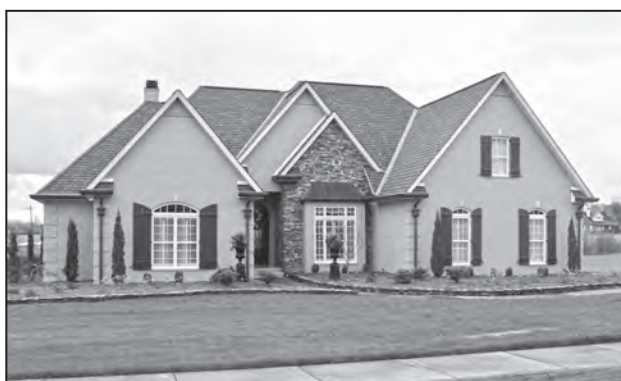
Stone Creek Crossing off Vervilla Road is filled with nice homes.

Waymon says four homes are currently in the construction phase at Stone Creek. The next