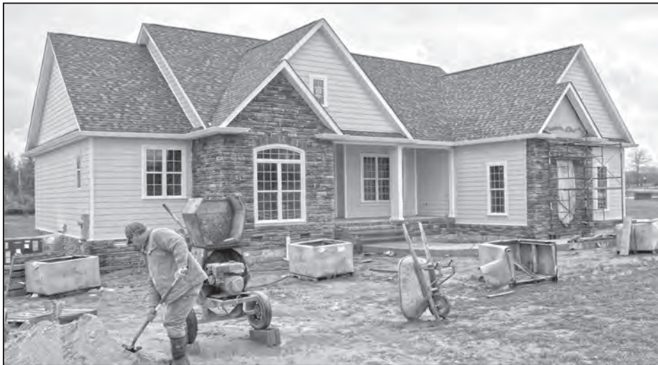
Pictured is one of four homes currently under construction at Stone Creek Crossing. Developer Waymon Hale says homes in the upscale subdivision are available from $250,000 to $400,000 and he plans to have three to five under construction at all times while the economy is strong.

"We're going to keep three to five under construction at all times during this first phase,"