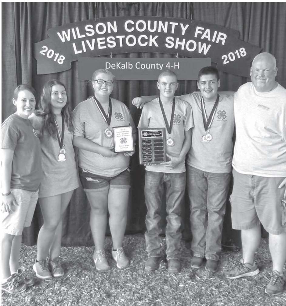
The local grill team will be heading to Regionals in Knoxville after taking first place in the Center Region 4H Outdoor Meat Cookery contest in Lebanon.

And, although they have been using the fields for some times, the DeKalb County Youth Soccer Program was officially granted permission to use the fields this year at Northside Elementary School for league play. The official granting of permission was needed so the recreational league could get covered by insurance.