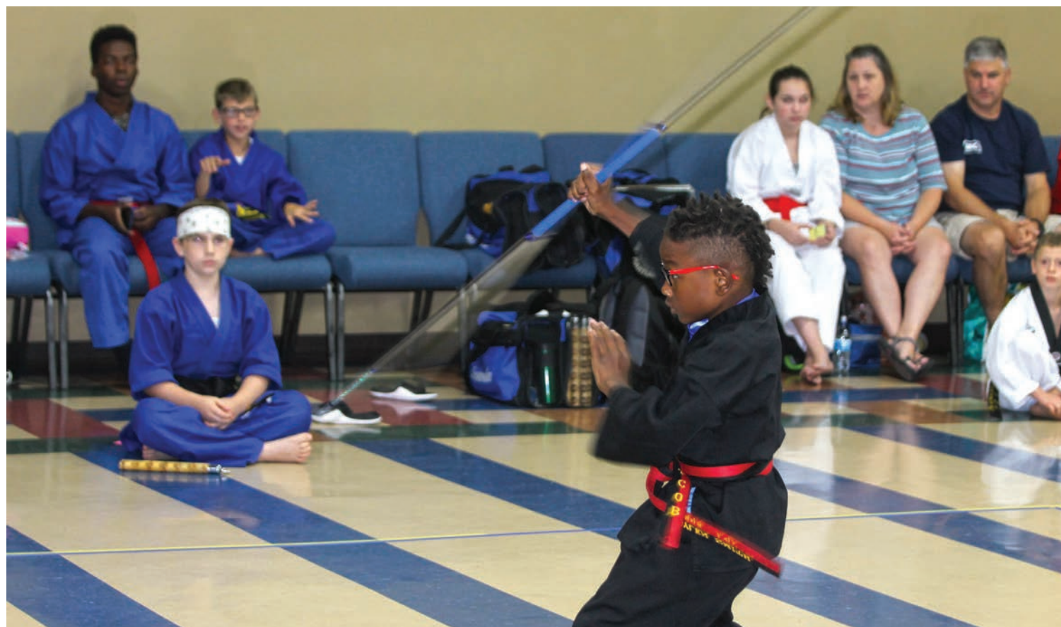
Competitors at the Douglas Ross Memorial Karate tournament ranged in age from 3 to 62. Along with fighting, weapons forms were demonstrated for the judges.

That ye may be the children of your Father which is in heaven: for He maketh his sun to rise on the evil and on the good, and sendeth rain on the just and on the unjust. Matthew 5:45