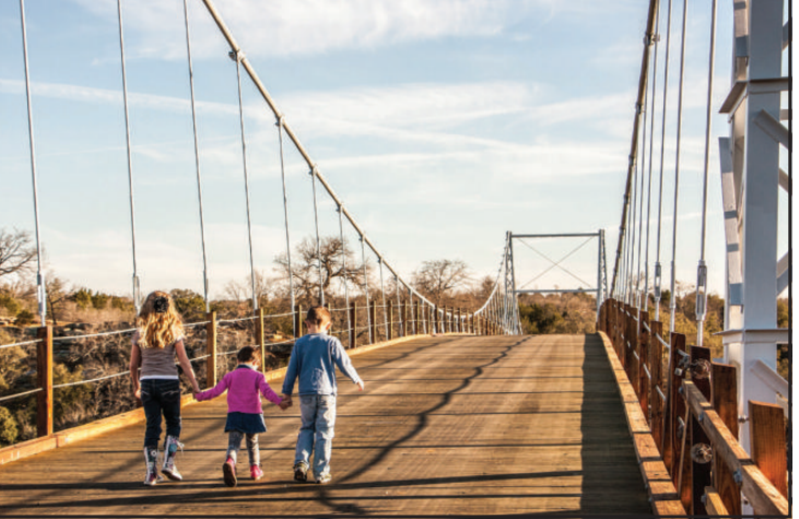
Regency "Swinging" Bridge, one of the last suspension bridges in service, is a favorite local attraction

The final work on the project consisted of installing a steel cable and