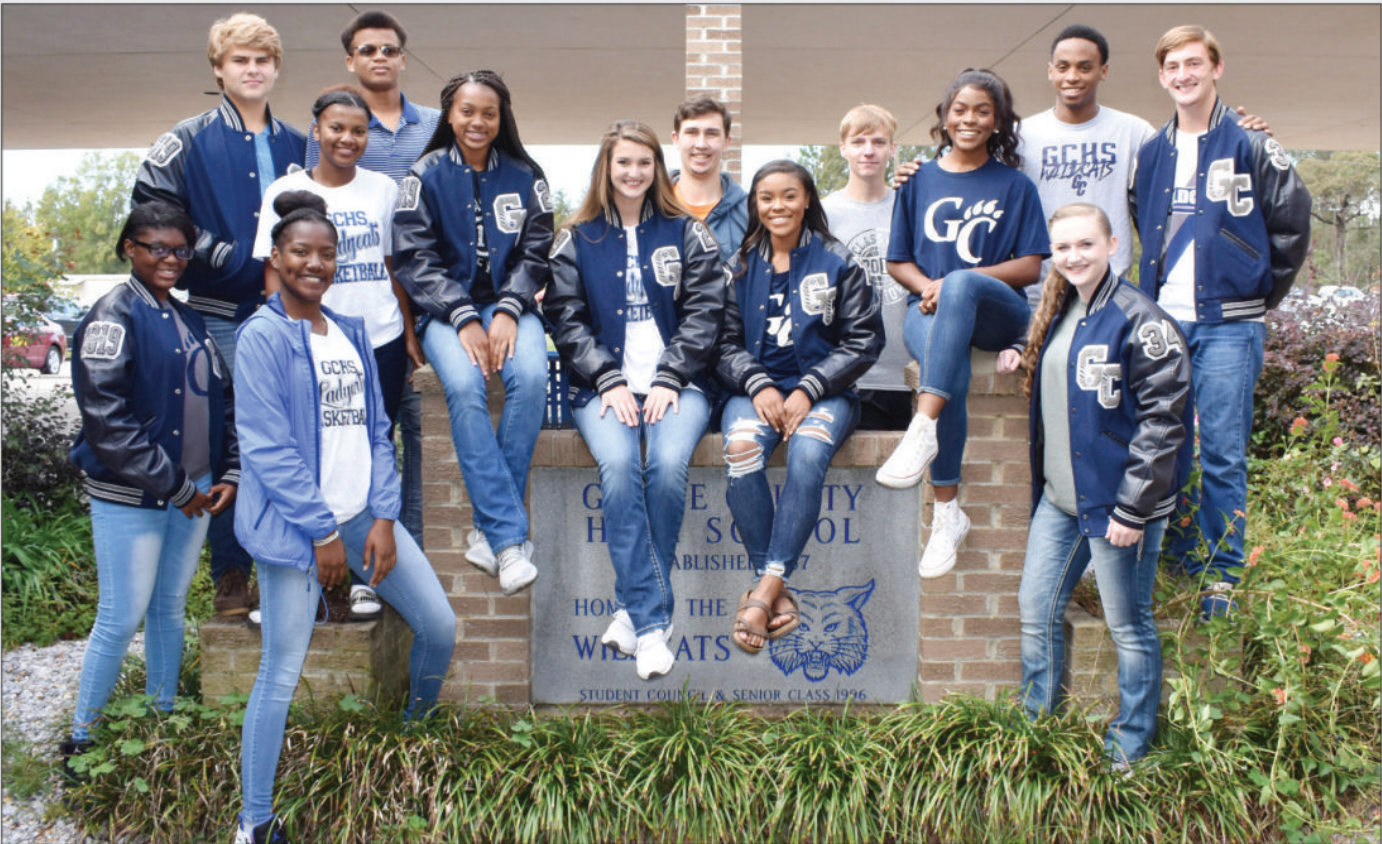
Shown above are senior basketball and soccer players from Greene County High School.