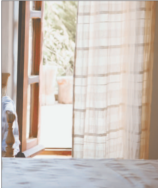
AIR OUT by opening all doors and windows whenever you are present. Leave as many windows open when you are not present as security concerns allow.

Use appropriate personal protective equipment to avoid injury from possible exposure to mold and bacteria including gloves, goggles, rubber boots, and N95 masks.