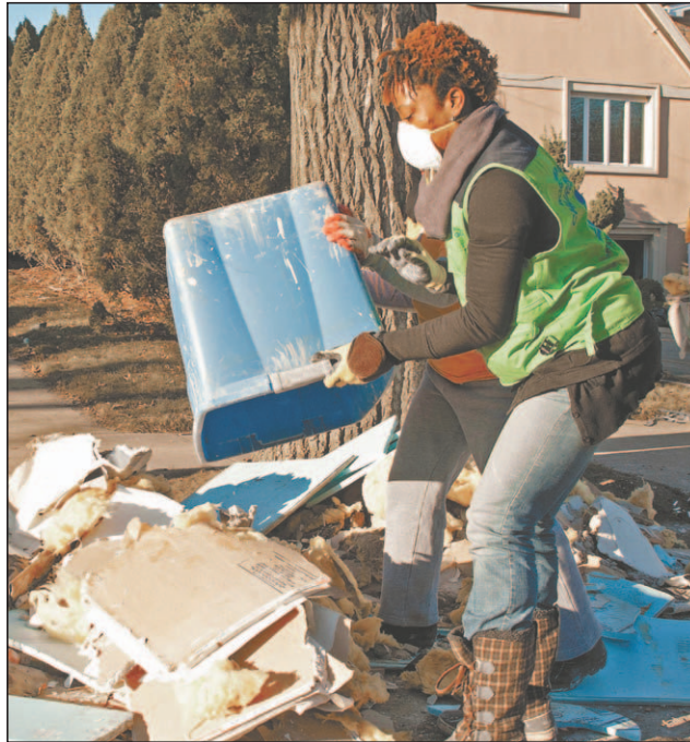
MOVE OUT saturated porous materials such as mattresses or upholstered items, especially those with visible fungal growth.