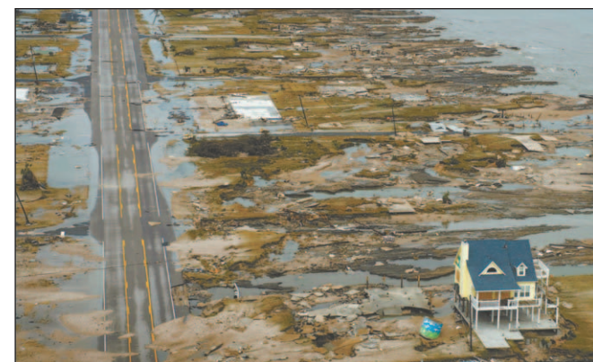
National Weather Service

read manually by dedicated volunteer observers. If you would like to volunteer as a cooperative observer, visit the website at: www.nws.noaa.gov/om/coop/become.htm