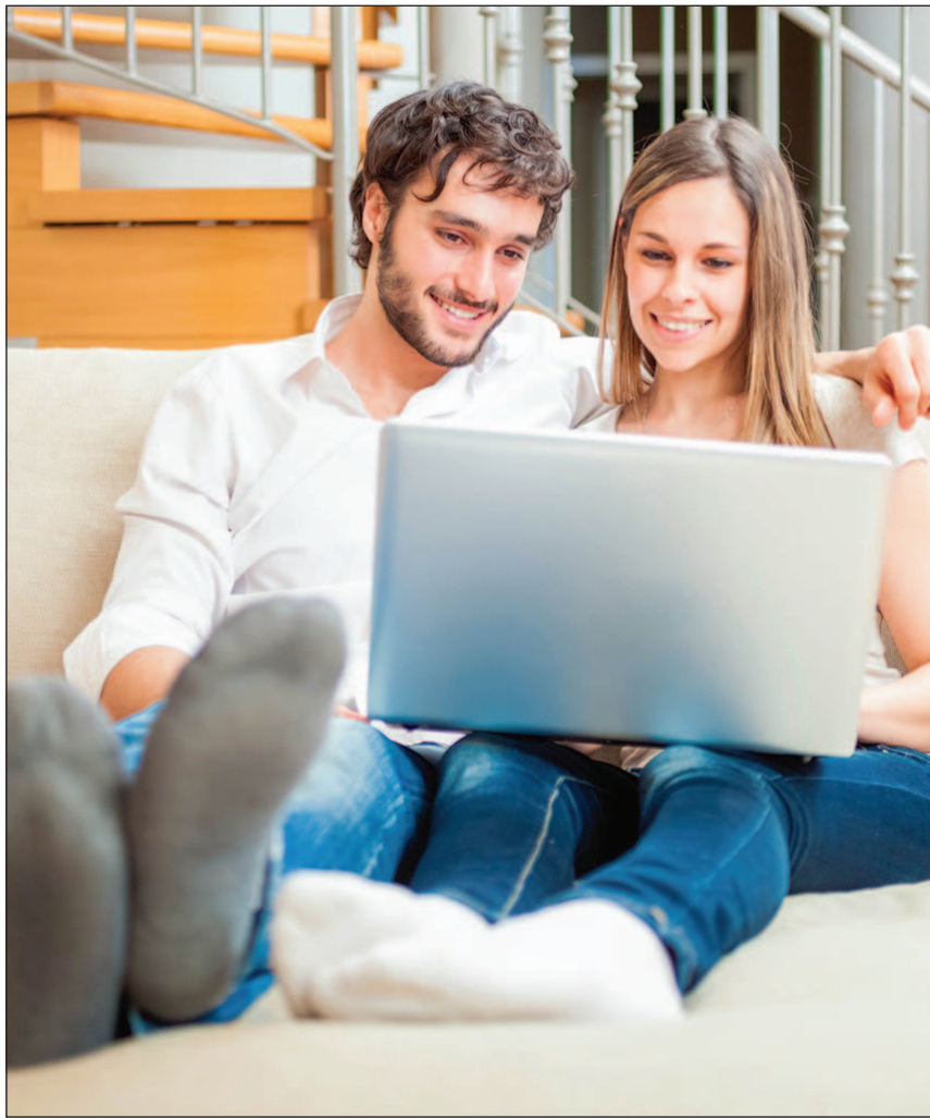
Wedding websites are yet another tool couples can use to stay organized as they plan their weddings.