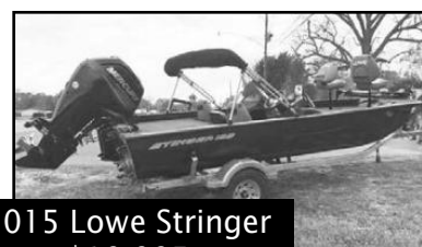
2015 Lowe Stringer $19,995

"Guaranteed credit approval on all vehicles!"