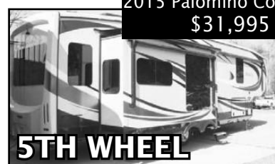
2015 Palomino Columbus $31,995