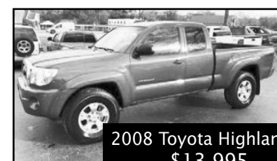
2008 Toyota Highlander $13,995

We sell Boat Trailers, UTV's, ATV's, Carports, & Sheds