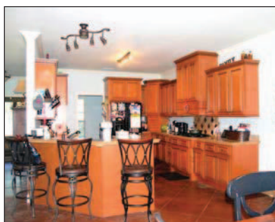
Beautiful brick home on 1AC located conveniently to Hwy. 43 & I-65. Outdoor features summer kitchen, covered patio. Scored concrete floors throughout, granite tile counter-tops, custom cabinetry, decorative hood, split bedroom plan, wood burning fireplace, open area family room with tray ceilings, study, large master suite with his & her closets, garden tub, separate shower and dual vanity.