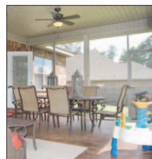
Beautiful hardwood floors throughout the main living area with tile in the wet areas, soaring ceilings in the living room, tray ceilings in the formal dining room and master bedroom, upgraded light fixtures, granite counter tops, double sided (gas-log) fireplace to the living room and sun-room, mud area, large master suite with plantation blinds and large walk-in-closet, spacious screened porch, double garage, fenced in back yard, and sprinkler system for the manicured landscaping.