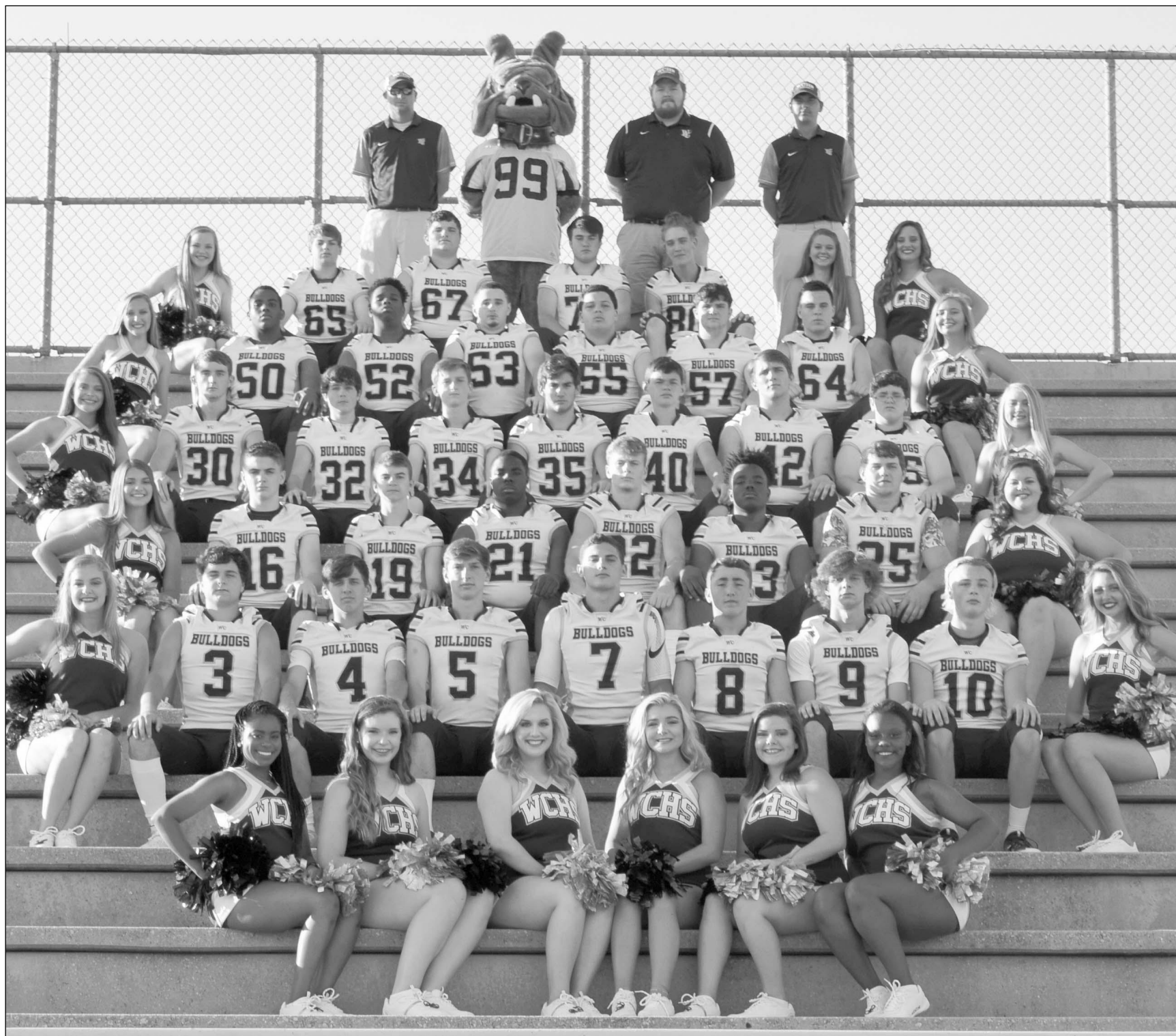
The 2018 Washington County High School Bulldogs