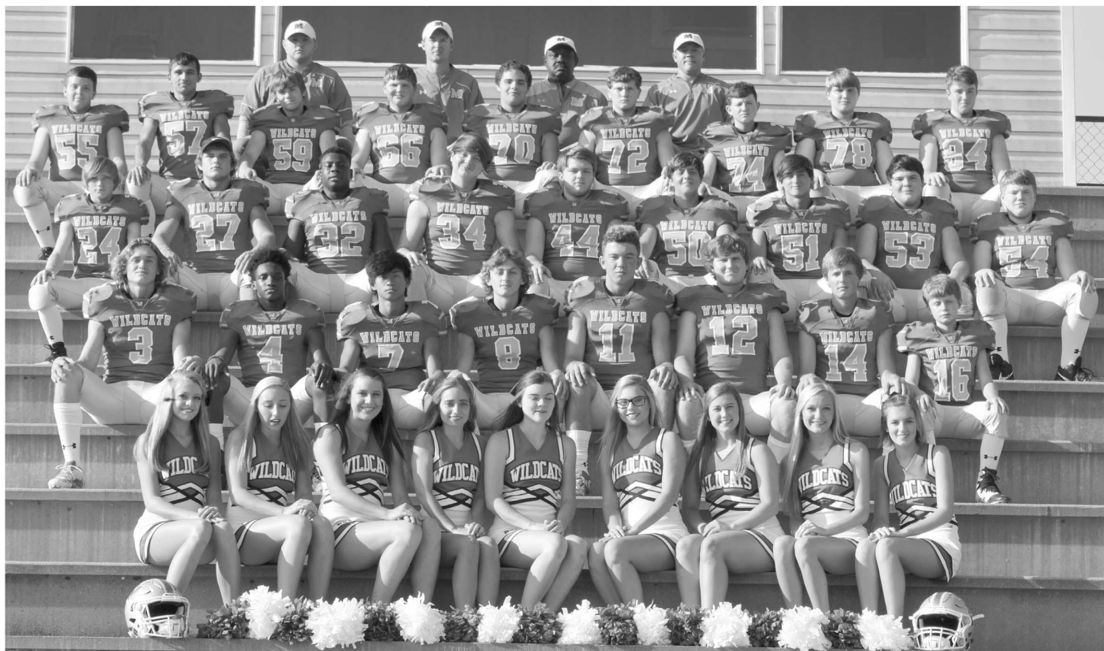
The 2018 Millry High School Wildcats